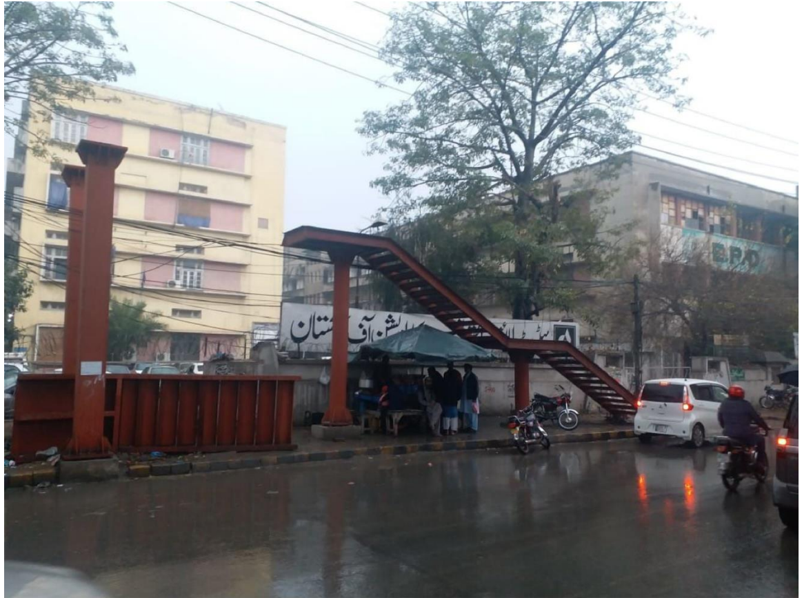
STATE LIFE BUILDING NO.2 STATE LIFE SQUARE LYTTON ROAD LAHORE