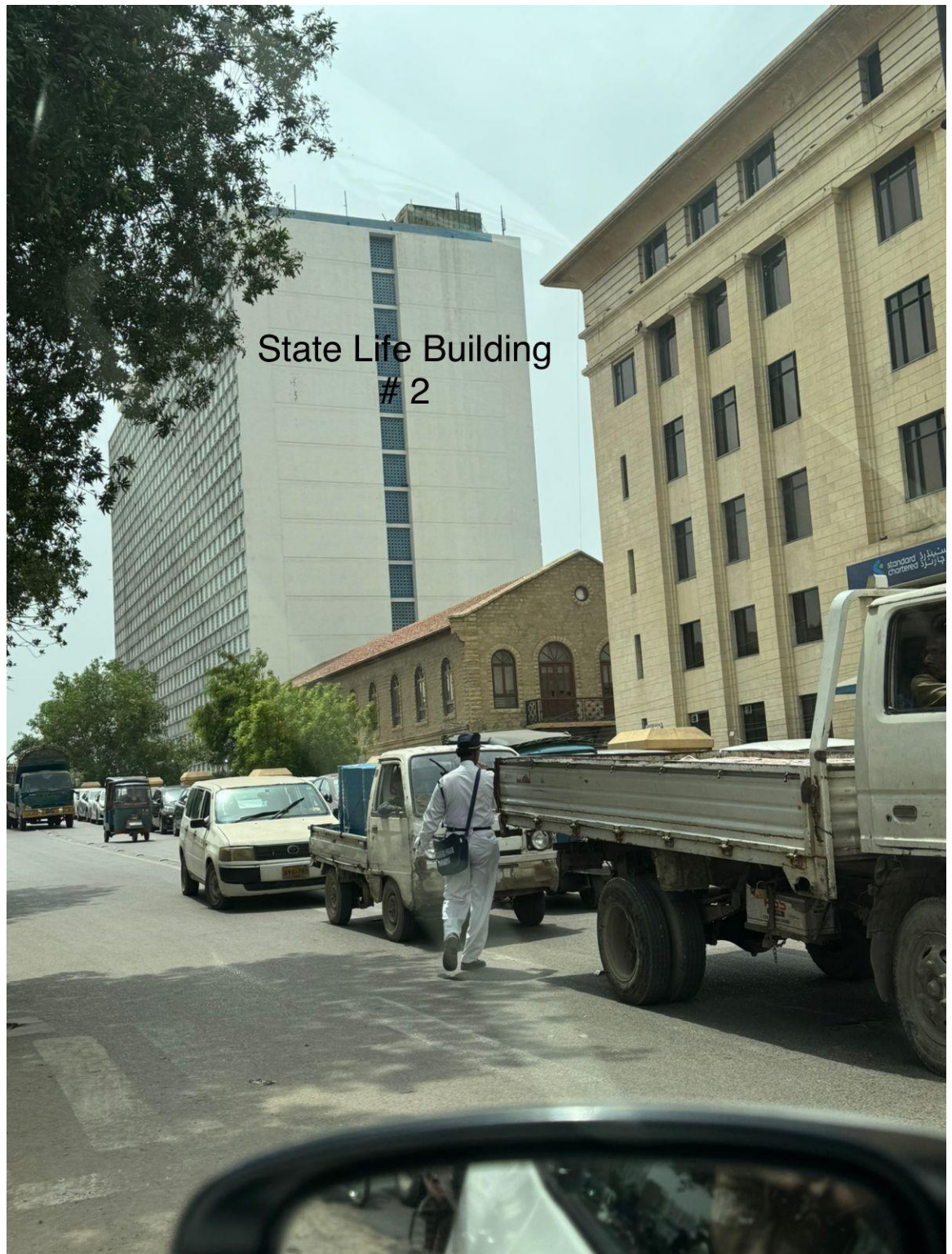
State Life Building # 2